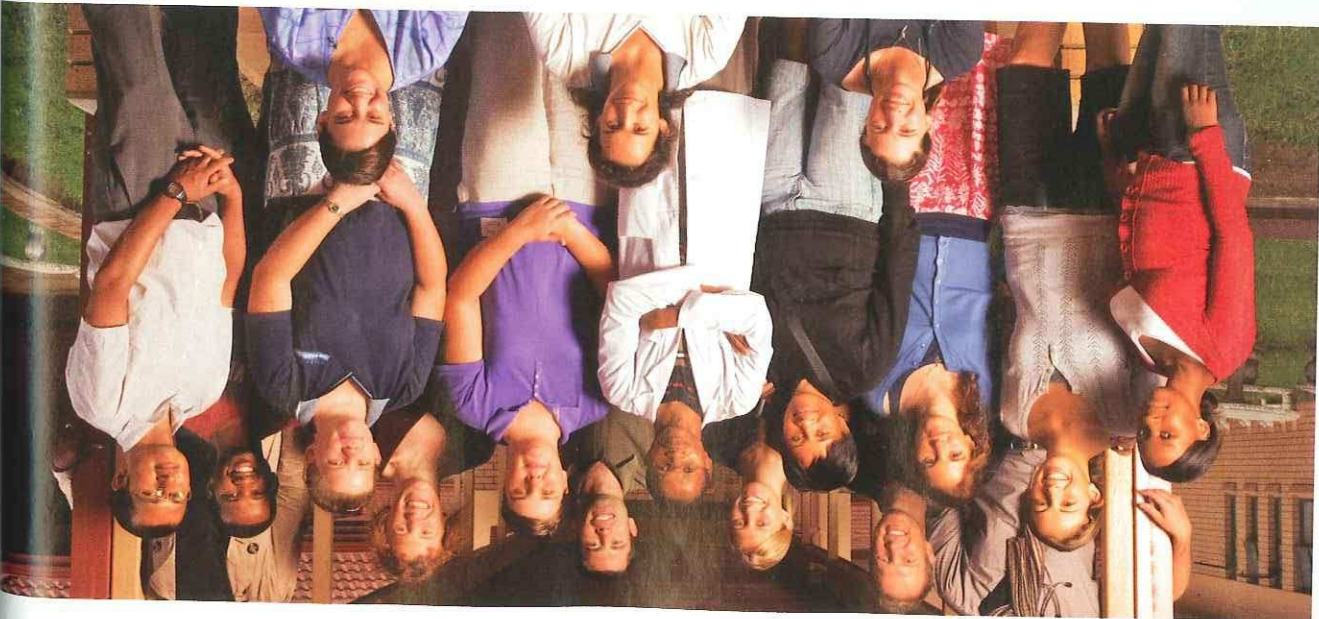
|| health foundation

“What keeps us here is not our jobs and our salaries. It's the knowledge that we are able to make a difference to people and their lives, by treating them with respect, dignity and care.”